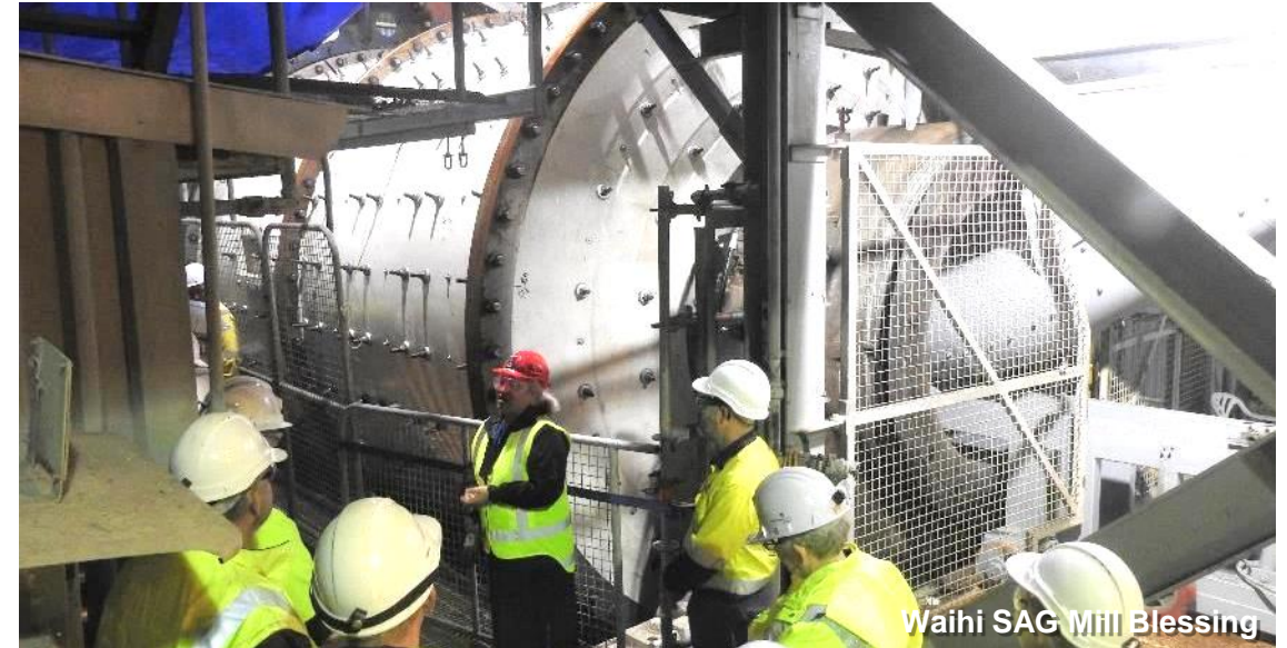
Waihi SAG Mill Blessing